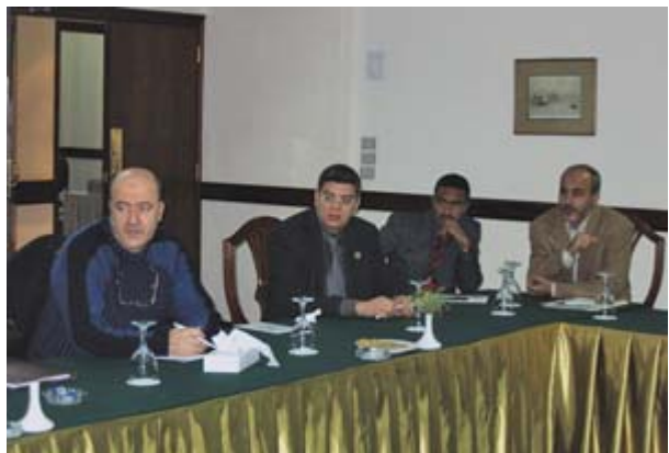
IAEA Workshop attendees