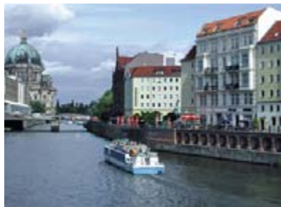
The Nikolai Quarter in Berlin-Mitte

Nearly all important Berlin buildings can be viewed at leisure on this cruise. The lively, nevertheless well-founded information is presented by two representatives of the structurally determining epochs. A representative of the classicist buildings will present the merits of this epoch, whereas the representative of the modern style will explain the glass and steel constructions of the period after the fall of the Wall.