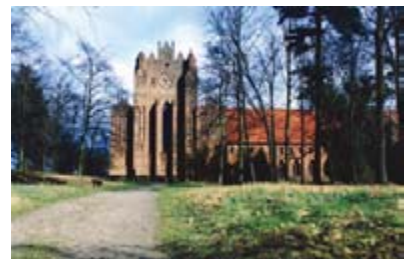
Monastery of Chorin

After lunch, a totally different structure will be viewed: a ship lift. It rises gigantically above the River Oder, lifting and lowering ships over a drop of 36 metres between the rivers Oder and Havel.