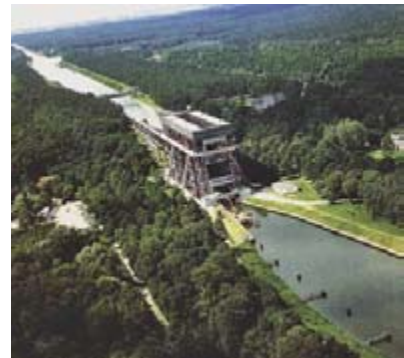
Ship Lift of Niederfinow

This trip takes you to the Mark Brandenburg region, to the Monastery of Chorin. The well-preserved Monastery structure of the Cistercians served as the model for many buildings of the monks in Northern Germany. The enormous church is a symbol of brick gothic, and the most varied types of Halls provide an insight into life at a monastery.