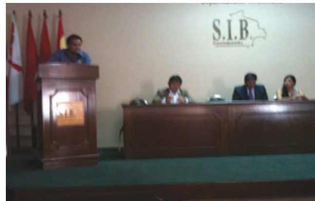
The first international meeting of ASBOSENDIC is opened in Cochabamba, Bolivia

The event enjoyed the participation of representatives from Colombia (Corporation for the Investigation of Corrosion Industrial University of Santander), Spain (AEND – Spanish Society of Non-Destructive Testing), Chile (Antofagasta University) and Brazil (ABENDI – Brazilian Association for Non-Destructive Testing and Inspection).