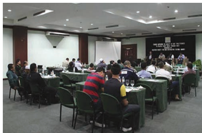
The panel from MSNT, the Department of Skills Development and the main end-user answering questions from participants

In our bid to promote and discuss various issues related to the certification of NDT personnel based on the National Occupation Skill Standard and ISO 9712, a special forum on certification, NOSS and safety was organised by the the Malaysian Society for NDT.