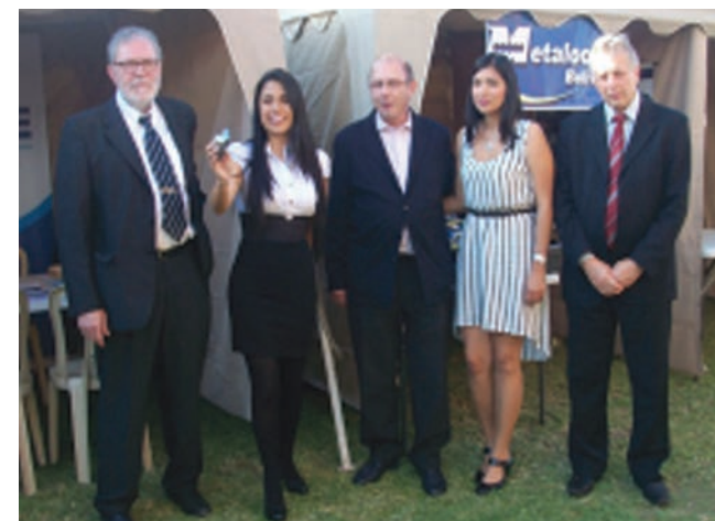
An exhibition was held in parallel with the event