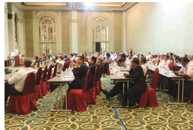
Delegates during one of the many presentations

The organising committee extends its gratitude to all involved.