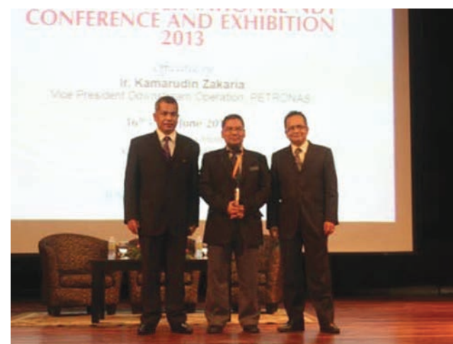
Dignitaries at MINDTCE 13