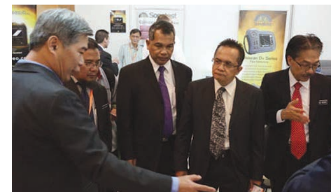
VIPs visiting one of the exhibition booths