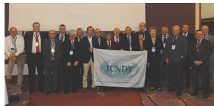
A further 17 members and associate members of ICNDT signed the MRA during NDT Week in Croatia

are being finalised, including those from Portugal and Finland.