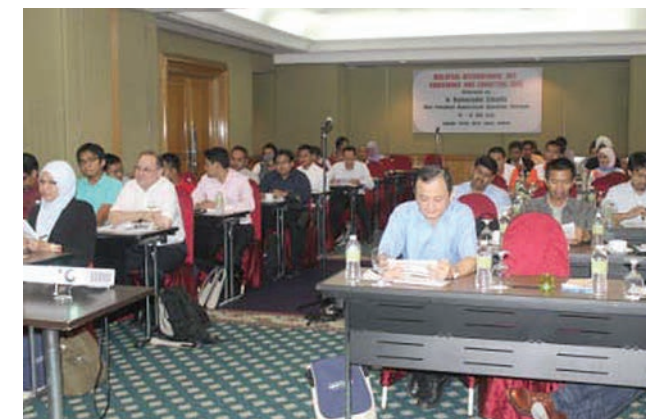
Participants at the pre-conference DIR course