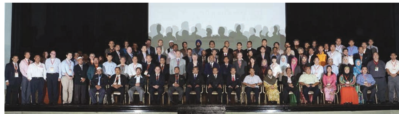
Delegates at the Malaysian Institute for NDT's 13th Conference and Exhibition held in Kuala Lumpur