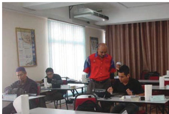
An ultrasonic examination taking place at SIRIM Bhd

A witness audit has been conducted by the National Accreditation Body, 15-16 July 2013, on the handling of examinations by the Department of Skills Development (DSD). The audit was part of the requirement to maintain the accreditation of MS ISO/IEC 17024 Personnel Certification Body. The audit was conducted on the examination of Ultrasonic Testing Level 2 (Direct Access) at one of DSD's appointed examination centres, iTC Skills Sdn Bhd.