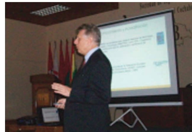
There were 24 papers presented, as well as talks from ABENDI and AEND and two from government bodies

An exhibition was held in parallel with the event. There were six exhibitors present that operate in providing welding and NDT services to the oil & gas industry. These exhibitors took