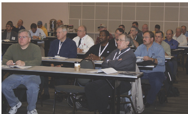
Conference attendees at one of the four short courses

The short courses included: a Master Class in the art of Phased Array Data Analysis addressing Detection, Characterisation and Finite Sizing of Welding Flaws; Measuring and Improving Inspection Performance; Applied Thermography for Non-Destructive Testing; and Introduction to Failure Analysis.