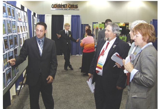
Student poster session

The 2009 conference brought together the international community of professionals who exchanged ideas to further the profession.