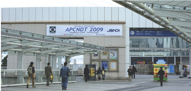
APCNDT conference venue

The conference was held at the Pacifico International Grand Hotel, which is located on Yokohama Bay and close to many shopping malls and entertainment centres.