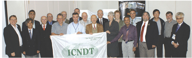
Some of the ICNDT PGP attendees