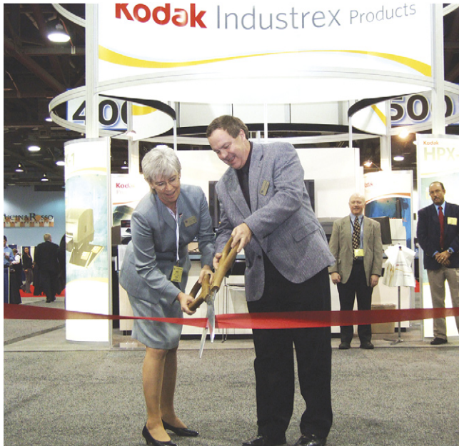
The Quality Testing Show 2009 is officially opened

The ASNT Fall Conference & Quality Testing Show 2009, Destination Columbus, was held 19-23 October 2009 in the Society's hometown of Columbus, Ohio, USA.