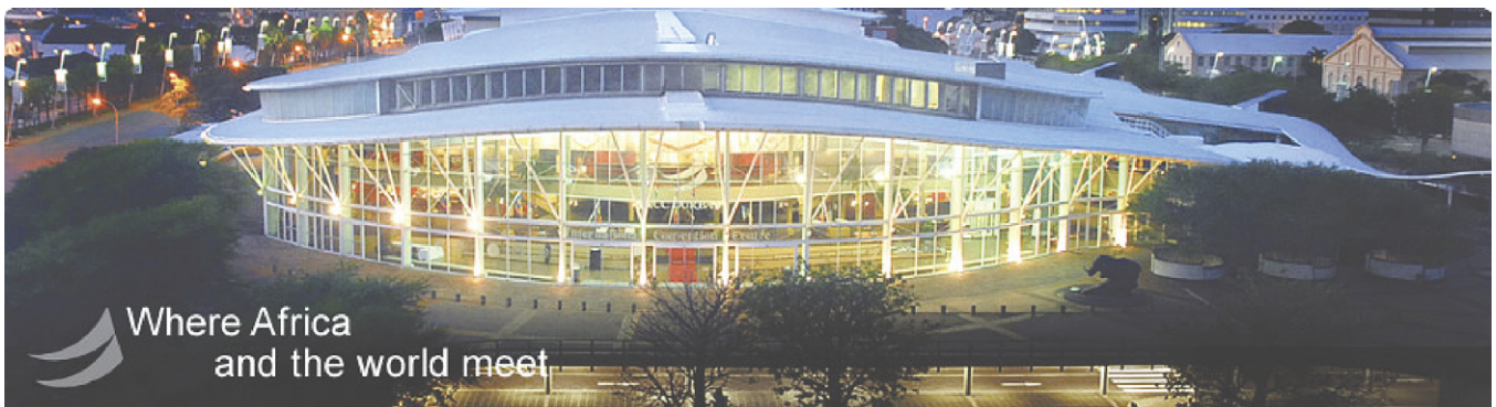
The ultra-modern International Convention Centre in Durban, venue for the 18th World Conference on Non-Destructive Testing