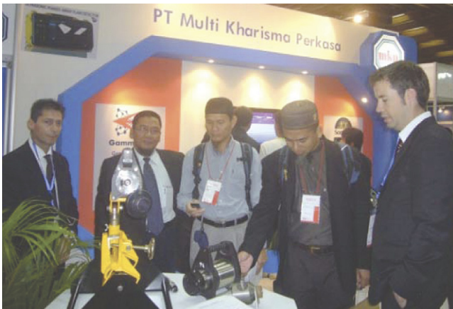
MSNT delegates visiting one of the exhibition booths belonging to a Malaysian company

Members of the Steering Committee of ICEM 2010 wish to thank all scientists, engineers and technologists who have given a tremendous response to our call for participation in this event. At the closing date we received more than 240 abstract submissions and around 300 participants from 25 countries. We also began to receive applications for participation in the exhibition, held in conjunction with this conference. Visit the website for further information: http://online.nuclearmalaysia.gov.my/sems/icem2010