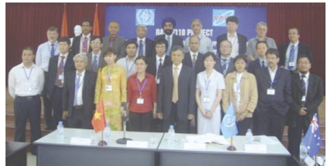
Participants of the meeting took a group photograph at the end of this meeting

In a bid to strengthen NDT technology to support our local industries, Malaysia has participated in an IAEA/RCA project on Advanced NDT. The project began in 2010 and is expected to end in 2012. The main focus of this project is to promote the application of the digital radiography method in member states. In addition, this project also addresses the need for accreditation of the NDT Certification Body (in accordance with ISO 17024) as well as NDT laboratories (in accordance with ISO 17020). The mid-term review meeting was held in Hanoi, Vietnam and attended by 20 individuals representing 14 member states. Malaysia was represented by the MSNT President.