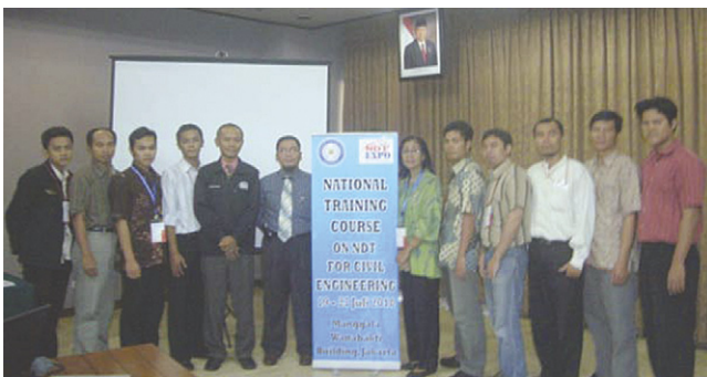
Some of the participants attending the National Training Course on NDT for Concrete Inspection

As a symbol of friendship, MSNT sent its delegation to this expo. The delegation comprised four MSNT members, led by the President who also presented a paper entitled: 'Expanding NDT Application for Concrete Inspection' in the seminar organised in conjunction with this EXPO. In addition, the MSNT President was also invited as one of the panelists in a special forum held during the EXPO, discussing various issues related to NDT. It is great to observe that, during this event, members of the MSNT delegation established links with various parties related to NDT and future collaborations were discussed.