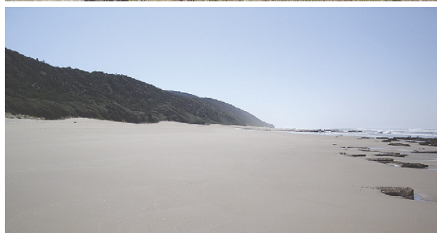
Some people think of Africa as a place of spectacular wildlife and unspoilt nature, of pristine beaches and lofty mountains