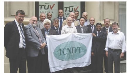
Several meetings took place in Vienna, revolving around the ISO/CEN discussions, among them a get together of ICNDT Working Group 1, the members of which are shown assembled outside the offices of TÜV Austria, headquarters of the Austrian Society for NDE, which kindly organised the activities