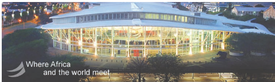
The ultra-modern International Convention Centre in Durban, venue for the 18th World Conference on Non-Destructive Testing

Management: The Conference Company. Tel: +27 31 303 9852; email: deidre@confco.co.za