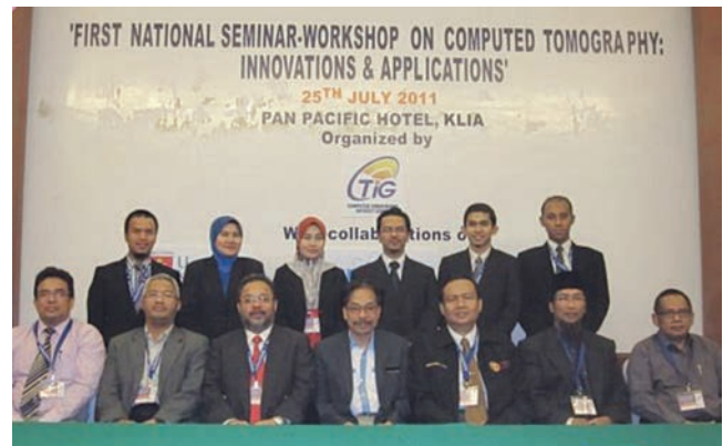
Attendees at the successful First National Seminar-Workshop on Computed Tomography