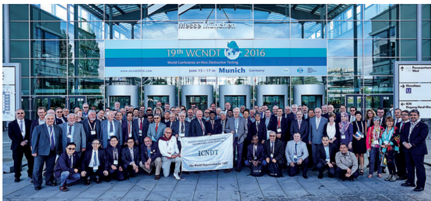
ICNDT General Assembly delegates

The closing ceremony provided an overview of the week's activities by means of a picture show, leaving a lasting memory of this fantastic event. Following society presentations of thanks and congratulations, everyone bade farewell until the next World Conference, the 20th WCNDT in Seoul, Korea, in 2020. See you there!