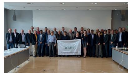
ICNDT Working Group 1 members in Munich

Assemblies and workshops on the use of social media by NDT societies and certification bodies, NDT and CM training and certification and e-learning for NDT and CM training.