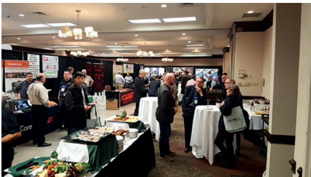
Participants enjoy the pre-conference Mix 'n' Mingle Reception

The event began on the evening of 15 November 2016, with the pre-conference Mix 'n' Mingle Reception. As participants registered and received their conference bags (sponsored by The Quality Control Council of Canada (QCCC)), they entered the exhibition hall and enjoyed a relaxing evening of food and drinks among colleagues.