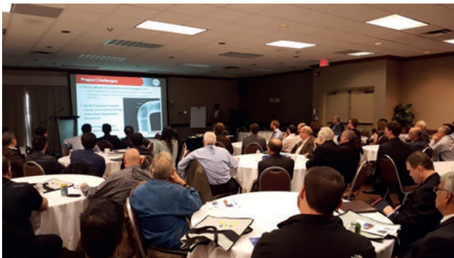
Barely a seat in the house – attendees watch one of the many presentations on day one of the conference

The annual conference of the Canadian Institute of Non-Destructive Evaluation (CINDE) was another one for the record books. This was the fourth event held in cooperation with CANDU Owners Group Inc (COG) and was CINDE's best-attended conference in the history of this partnership. On day one of the technical presentations there were times when there was only standing room available in the track rooms. Presenters from across the world provided attendees with the latest advancements in NDT research and technology – one of the many reasons so many participated in the annual conference.