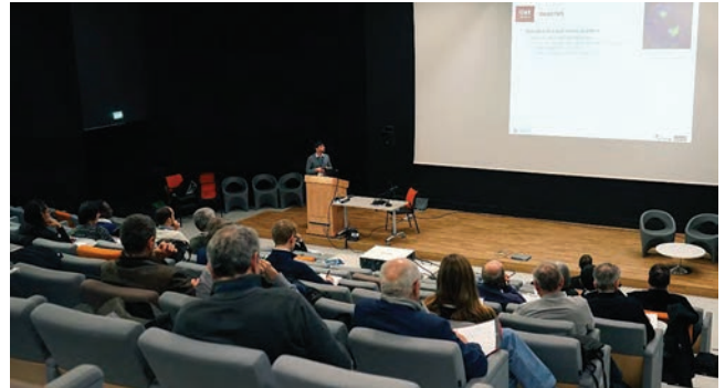
The doctorands, generally in their second or third year of thesis, had 25 minutes to present their work

As in the previous edition, the industrialists' poster session triggered discussions from the very first day and put forward the expectations of participants in the field. The next day, the exchanges continued in workshops centred on the career development and