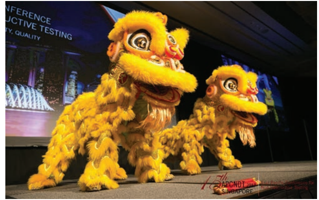
The conference was opened with a traditional lion dance

and Members thank all the delegates, participants, exhibitors, sponsors and supporting NDT societies for their strong support and contributions.