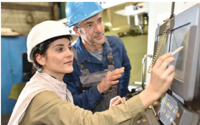
The university offers a range of comprehensive non-destructive testing and evaluation training, from bac +2 to bac +8

The university offers a range of comprehensive non-destructive testing and evaluation training, from bac +2 to bac +8, with a speciality in acoustics and physics, and is open to employees, students, job seekers and people in professional retraining.