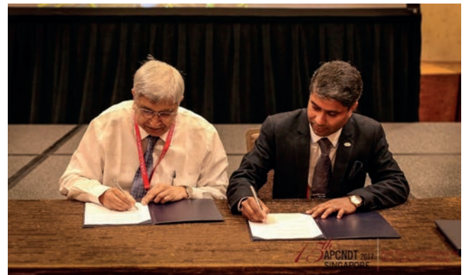
NDTSS signed two bilateral MOU with ISNT and MSNT

NDTSS presented its first ISO 9712 certification during the conference; the certification was achieved as a result of the Integrated Work Study Programme (IWSP) developed by the Singapore Institute of Technology (SIT) and NDTSS. The programme is the first of its kind in the region and is expected to attract young graduates to the industry.