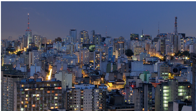
The meeting will be held in São Paulo, Brazil

This year, the Brazilian Association of Non-Destructive Testing and Inspection (ABENDI) is launching a new event, the first edition of the Technical Inspection Knowledge Journey (1st JTIC), to take place 28 August 2019 in São Paulo, Brazil. The event aims to provide attendants, in a dynamic and innovative environment, with a forum for the discussion of innovative techniques in the industry and a demonstration of products and services, bringing together the main players in the area of inspection.