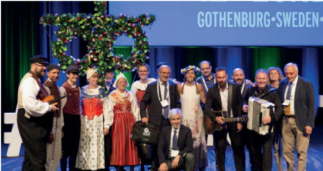
The Midsummer celebration was the theme for the venue decoration

From 11-15 June 2018, the NDT community gathered in the city of Gothenburg, situated on the west coast of Sweden, for the 12th European Conference on Non-Destructive Testing (ECNDT). The ECNDT is held every four years, this time through the cooperation of the Nordic NDT societies, with the Swedish NDT Society in the lead. The venue was the Swedish Exhibition & Congress Center in Gothenburg, situated in the heart of the city and connected to the large three-tower hotel complex, Gothia Towers. In this period of the year, the Midsummer celebration takes place in Sweden, which was the theme for the decoration of the venue.