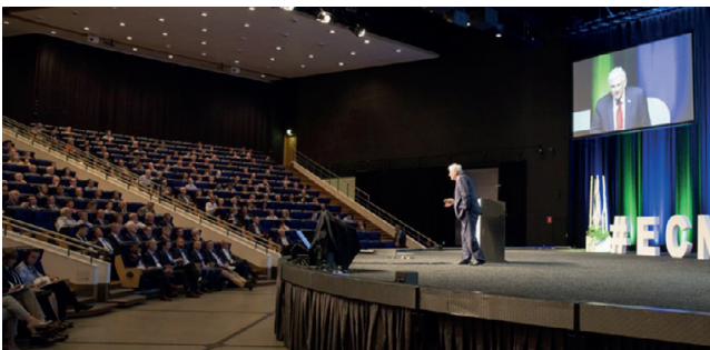
The Opening Ceremony included several presentations