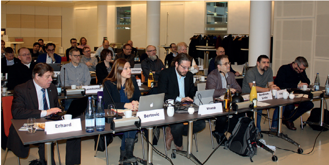
Members of the Technical Committee for Digitalisation in NDT in Berlin, February 2018

In 2018, the German Society for NDT (DGZfP) established a Technical Committee for Digitalisation in NDT. The short-term NDE 4.0 clearly shows the goals of this committee. Advanced digitalisation within factories will result in a new fundamental paradigm shift in industrial production. The vision of future production contains modular and efficient manufacturing systems. Non-destructive evaluation (NDE) is going to be an important part of this technological shift.