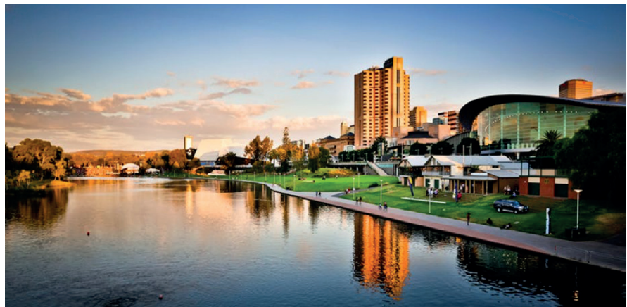
The conference will be held in the beautiful surroundings of Adelaide in South Australia

The Australian Institute for Non-Destructive Testing (AINDT) is pleased to announce that it will once again be hosting a national conference this year in the beautiful state of South Australia. The 2019 AINDT Conference and Trade Exhibition will be a three-day gathering of non-destructive testing (NDT) and condition monitoring (CM) experts from a wide range of industry, research and academic backgrounds. The event, to be held 4-6 November 2019 at the Adelaide Convention Centre, Adelaide, promises to be a premier networking event that will promote an environment for discussion of modern trends and current advances in the ever-increasing and demanding fields of NDT and CM.