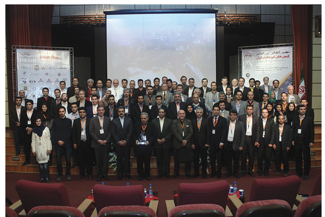
The 3rd Iranian International NDT Conference and Exhibition was attended by over 600 participants

The Iranian Society for Nondestructive Testing greatly appreciates the support of ICNDT and other parties who helped in making this event a unique and memorable NDT experience for everyone.