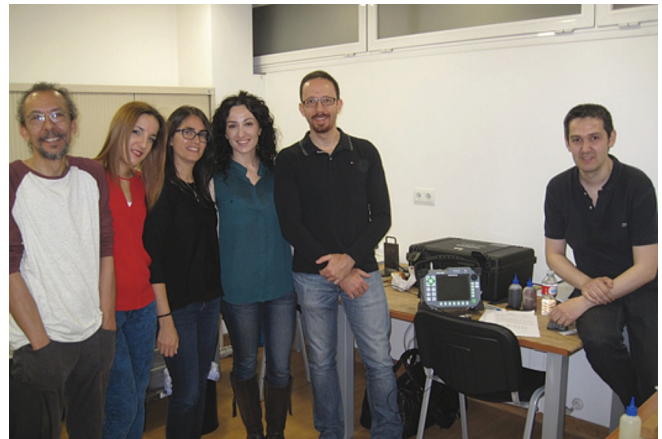
Students, staff and teacher at the pilot blended training course conducted by the Spanish Society for NDT (AEND)

Thus, it was observed that the knowledge and skill levels attained by these students exceeded those reached in traditional classroom courses. This reinforced AEND's conviction to further develop this type of mixed training, which is more adapted to modern times and the new demands of clients.